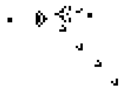
Figure 12.2: ... in action.