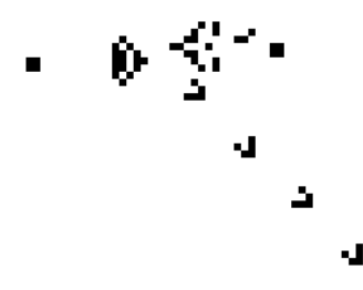
Figure 12.9: ... in action.