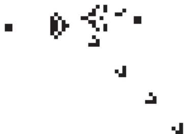
Figure 12.2: ...in action.